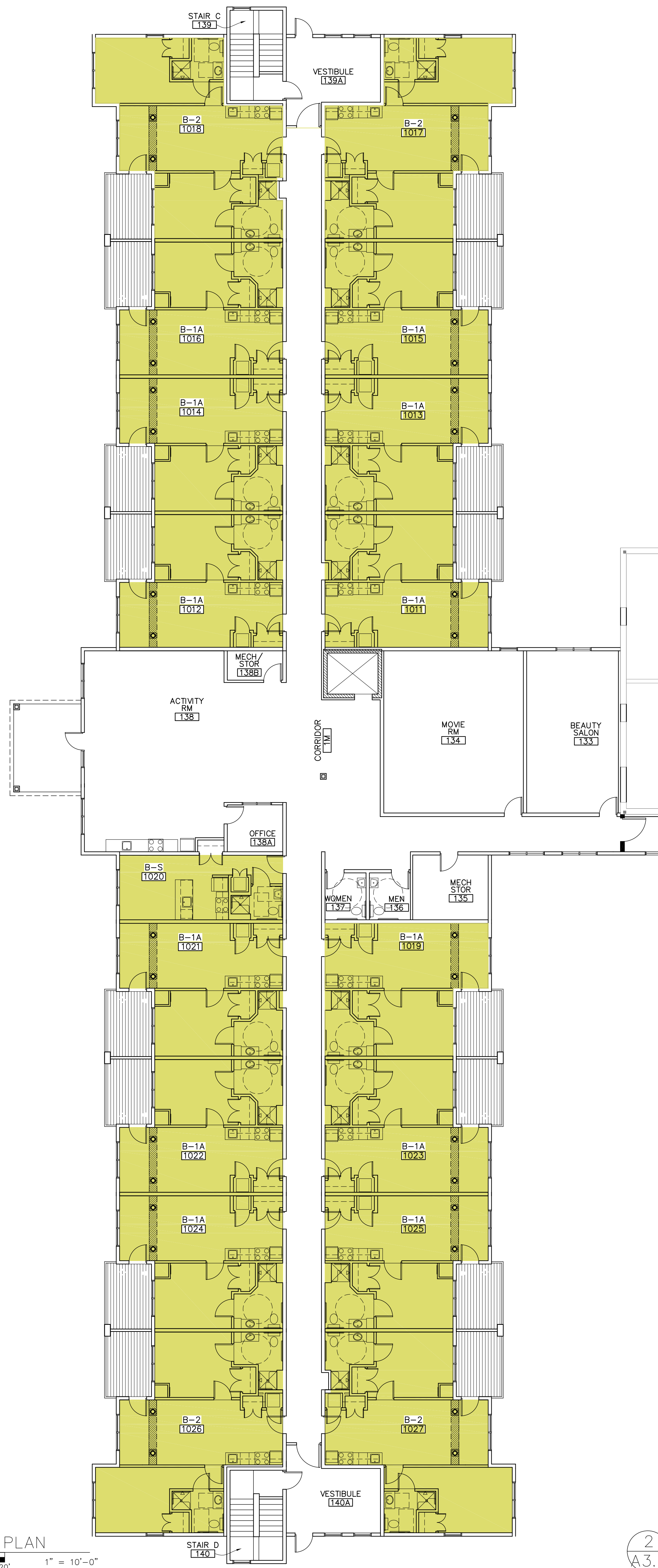
1 A3.2 BUILDING 2 FIRST FLOOR PLAN